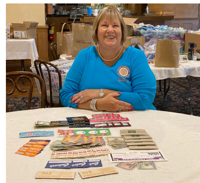
Personal Care Products Drive collected 4771 items for the Homeless Youth Initiative.