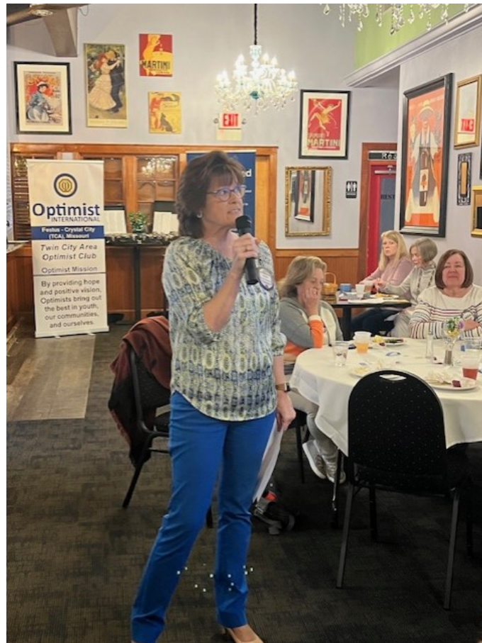
Jefferson Franklin Community Action Corporation Presentation-March 21, 2024

A wealth of information on Jefferson Franklin Community Action