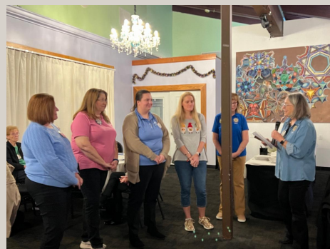
New members inducted on March 14, 2024