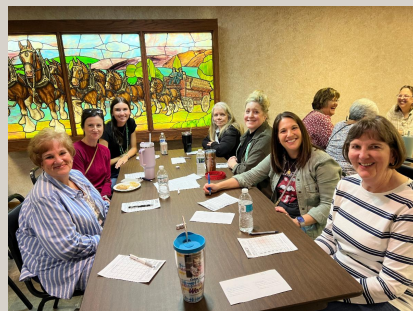
Members and guests had a great time.