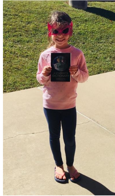
Not to be forgotten, a virtual Sunrise student received her dictionary.

Thank you so much Twin City Optimist Club for your generous donation to Sunrise School! We are blessed to be part of this community- your giving hearts are appreciated.