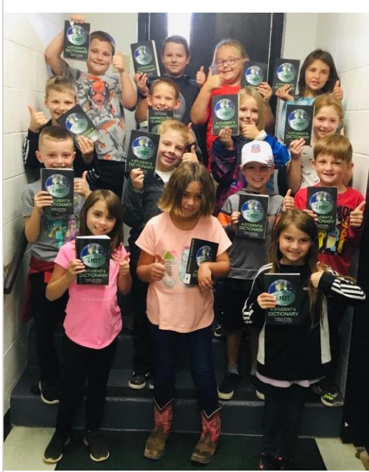
Students from Sunrise School in the Sunrise School District receive their dictionaries.