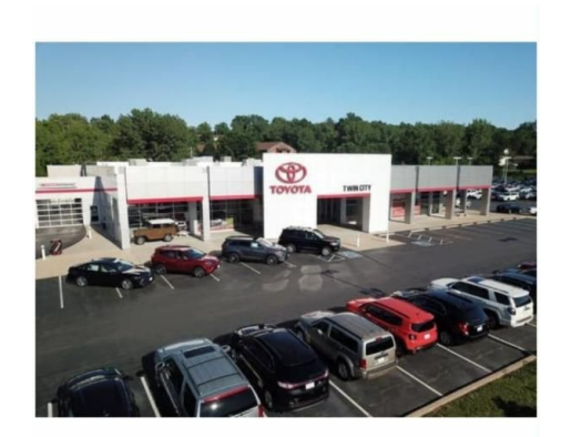
Twin City Toyota