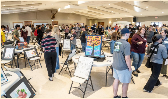
Students, parents, teachers, and other attendees browsing the art work