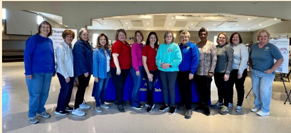
The setup crew