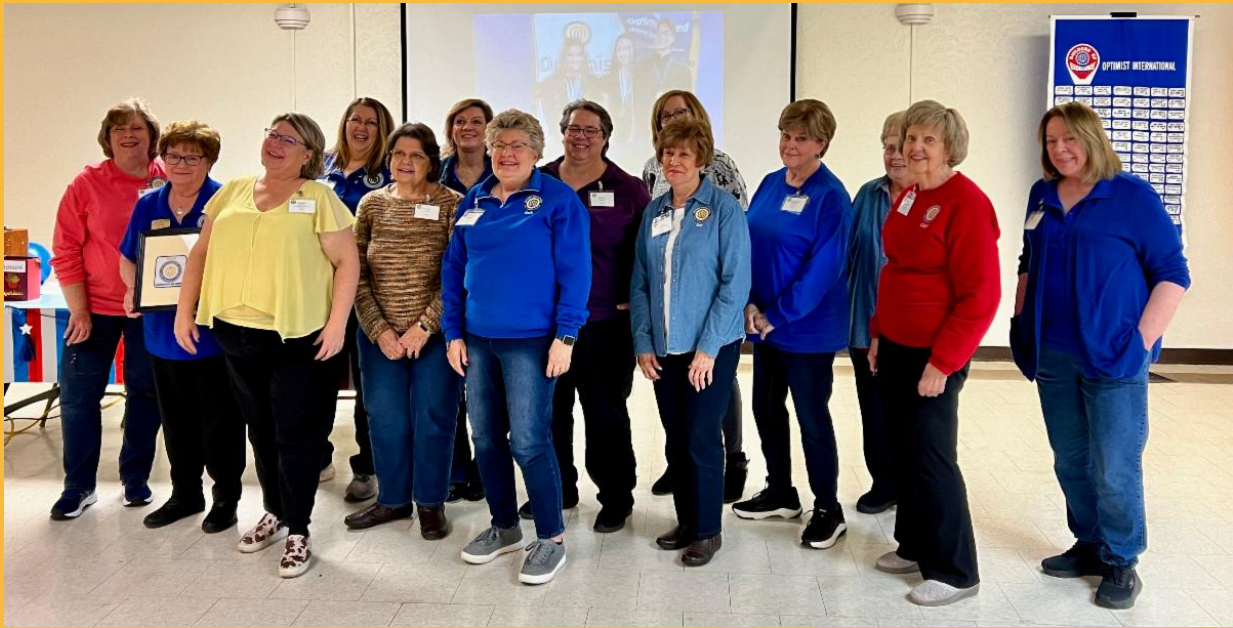
Twin City Area Optimists accept first place for the EMO District 2023-2024 Awards and Achievements honor.