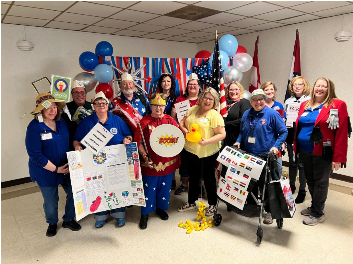
The East Missouri Optimist District Leadership Team was introduced with a "fashion Show". District officers and committee chairs dressed to represent their position. Thanks to all the TCA members serving the district this year.