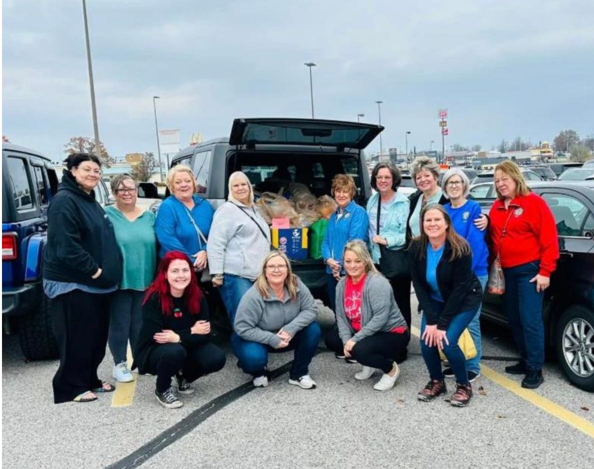
Optimist Shoppers wit the Head Start team