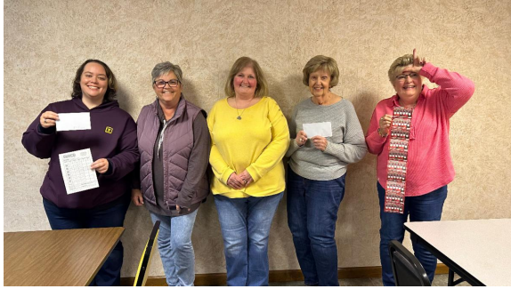
Winners and loser of the night