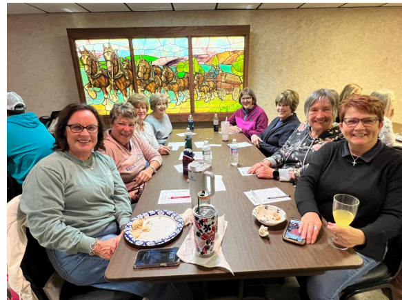
Ready to play!