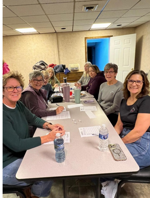
Lots of potential winners