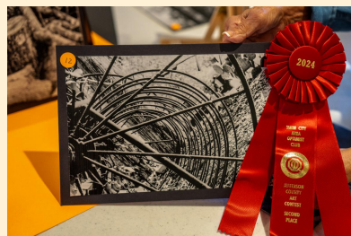
2nd Place Photography - "Block and White" by Morgan Wagner, DeSoto High School