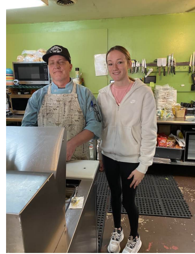
Cool Beans Staff

The final result was $110 as well as well as $8 in donations.