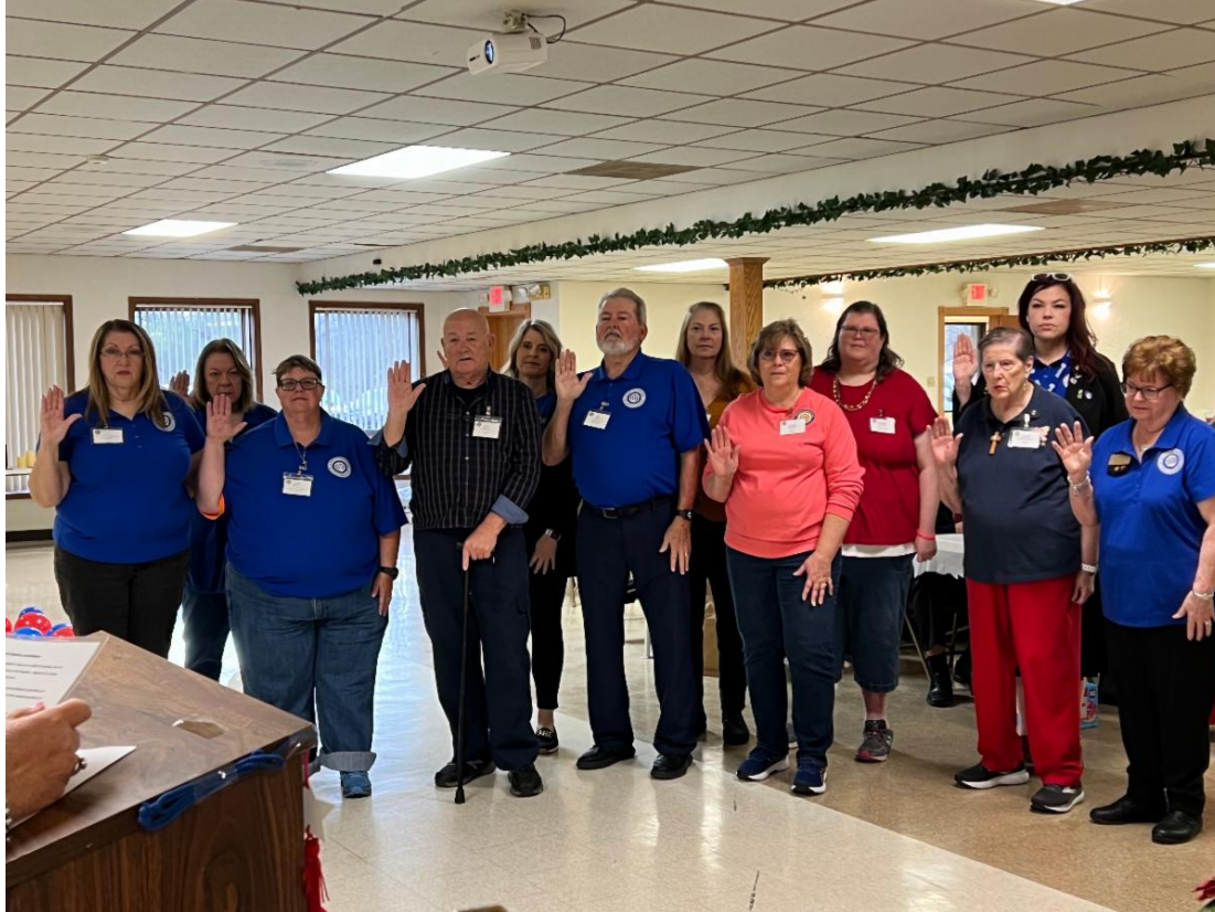
Installation of EMO Board of Directors. Board of Directors includes the Executive Committee and club presidents.