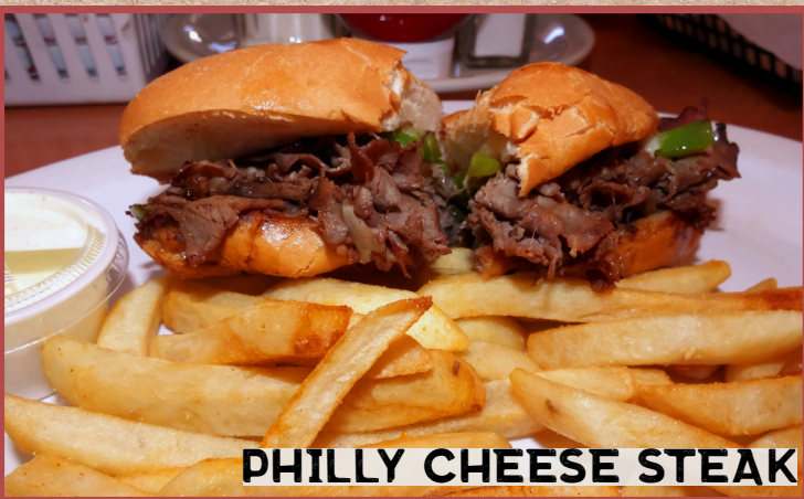
PHILLY CHEESE STEAK