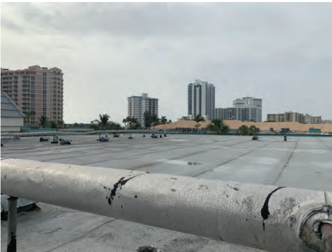
2021 FBC modified roof