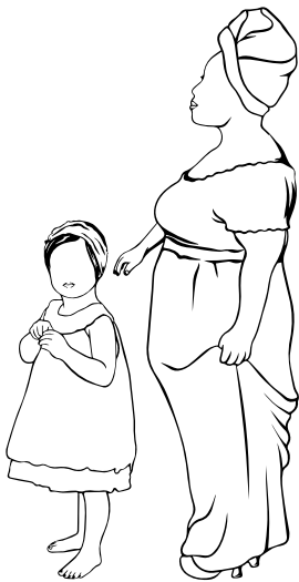
IN 1816, AN ENSLAVED WOMAN ESCAPED WITH HER 2-YEAR-OLD DAUGHTER FROM ORANGE, NJ. SHE WAS CAUGHT AND PUT INTO NEWARK'S JAIL ON BROAD STREET.