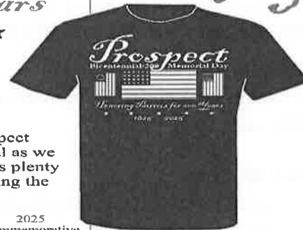
2025 Commemorative T-shirt