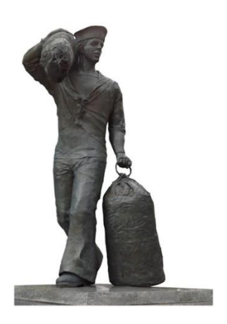
President's Report Fall 2017