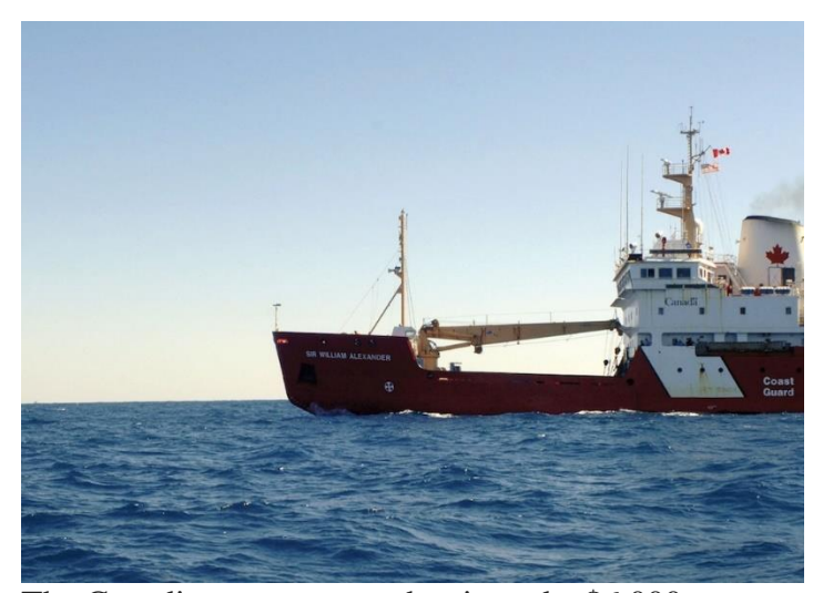
The Canadian government has issued a $6,000 speeding ticket to a Canadian Coast Guard ship for travelling over the posted speed limit in the western Gulf of St. Lawrence.

Since August 11, 2017, Transport Canada has been imposing a 10-knot speed limit for larger vessels operating in designated areas of the Gulf of St. Lawrence due to the increased presence of right whales in the area. The speed restriction applies to ALL vessels of 20 meters or greater travelling in the western Gulf of St. Lawrence, between the Quebec north shore and just north of Prince Edward Island.