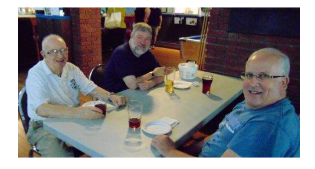
Naval members enjoying the refreshments