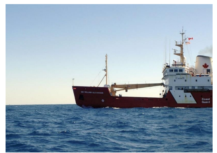
The Canadian government has issued a $6,000 speeding ticket to a Canadian Coast Guard ship for travelling over the posted speed limit in the western Gulf of St. Lawrence.

Since August 11, 2017, Transport Canada has been imposing a 10-knot speed limit for larger vessels operating in designated areas of the Gulf of St. Lawrence due to the increased presence of right whales in the area. The speed restriction applies to ALL vessels of 20 meters or greater travelling in the western Gulf of St. Lawrence, between the Quebec north shore and just north of Prince Edward Island.