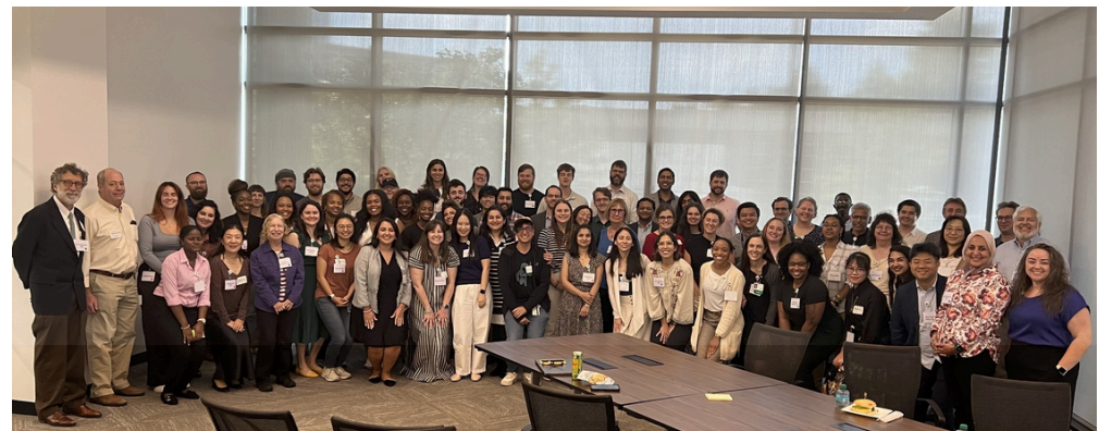
2025 CF-AIR Research Retreat