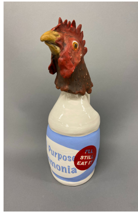
Left Image: Deborah Brooks, Stoplight , oil on canvas, 24 x 36 in. Right Image: Allison Olson, Certified Chicken Shit , ceramic clay and glaze, 5 x 5 x 12 in.