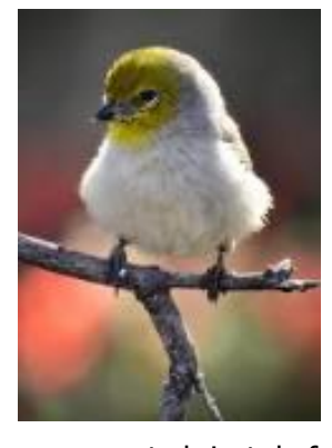
By Orvalita Hopkins, Bird Chairman

Situated high in our palo verde tree, over-hanging a lush desert landscape, there is a wonderful neighborhood teeming with all the amenities you need to raise a family of virdens. With easy access to twigs, bugs, water, and seeds, our tree was host to a wonderful nest of virdens as it is every spring. The rather large nest