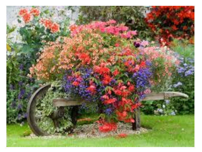
Now let's get started planting!

Container 14" in diameter: 1 plant of each: houseplant mother-in-law's tongue, fuchsia, golden club moss, impatiens ('Cherry Splash'), begonia, mother fern.