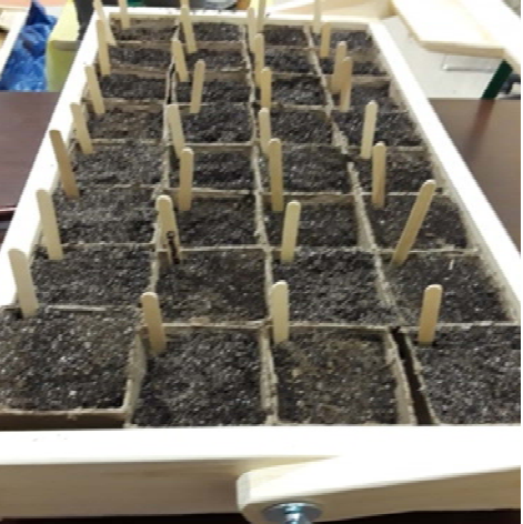
read a book and followed it with a short hands-on project. We read about worms, soil, and planting seeds. bean We planted bean seeds with the children. We read that

ladybugs and butterflies are good for plants, but caterpillars and larvae are not. We brought samples of