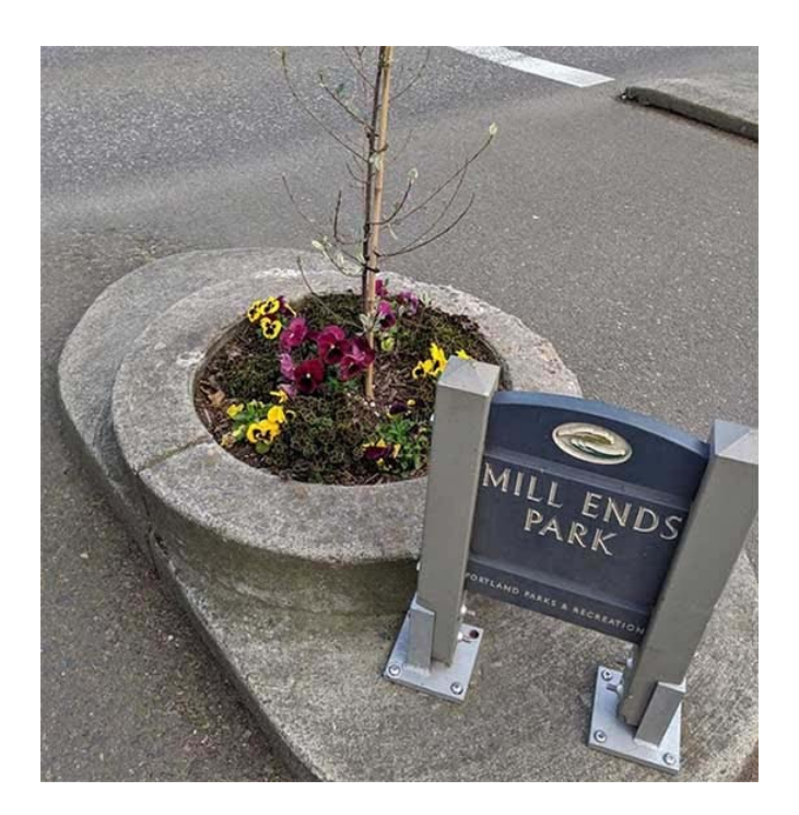
The world's smallest park is located in Portland, Oregon

We look forward to dedicating more in 2020, beginning with the rededication of the Biggs Junction Blue Star Highway Marker (#17), destroyed in the late 1960s and never replaced. It will be done on March 29 in conjunction with the OSFGC Spring Board Meeting, at the Deschutes River State Park at its junction with the Columbia River. We also plan a rededication and move of the Washburne Memorial Marker (#6) to the South Benton Museum. Our dreams include possible new markers at Bly in Southern Oregon, Camp Rilea on the Oregon Coast, and the Memorial Park in Wilsonville. At this point we dream big and pray for more. We are blessed with a dedicated group of BLUE STAR MARKER warriors.