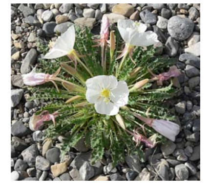
in the noonday sun. Tufted evening primrose grows

elevations in the Rockies. This wildflower has large. fragrant white flowers that open at sunset and reflects the evening moonlight attract pollinating moths. The following day the flowers fade to pink as they wither