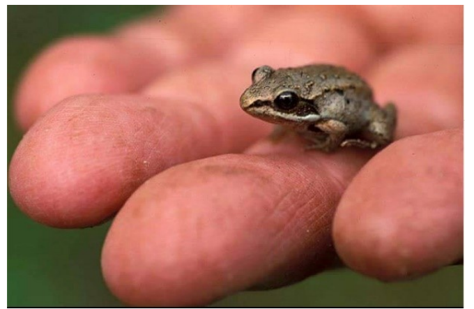
Southwest, Southcentral, West and Central Alaska.

Columbia Spotted frog, in the Southeast, and Rana sylvantica , or Wood frog (see below), as it is known. The Wood frog has been found in Southeast,