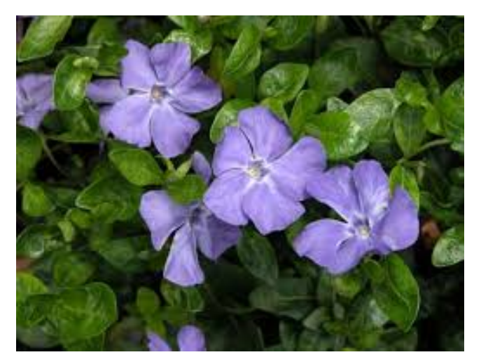
Vinca minor 'Bowles Variety

Garden clubs are educational organizations which offer opportunities to their members for constant and continued learning. The educational programs like Flower Show Schools are what makes garden clubs affiliated with National Garden Clubs different than just another neighborhood club. I have been asked, "Why do we have to study this or that?" I ask "Why not?" There is something new and different to learn each day.