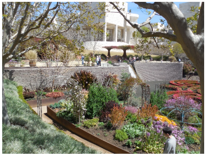
learned that tea grows on a camellia bush. You probably knew that, but one of my favorite things about garden club is that I am constantly learning or reinforcing learning about plants.

The 76th Annual Convention of Pacific Region Garden Clubs, Inc. took place April 7-10, 2019 at the Airtel Plaza Hotel in Van Nuys, California. The theme was "Soaring to New Heights" and we certainly soared with airplane viewings and butterflies. Hosted by California Garden Clubs, Inc. the preconvention activities included tours to Descanso Gardens led by a camellia grower and I