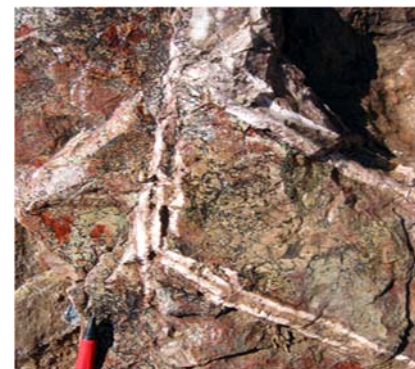
Tonopah Property, Discovery Zone Outcrop