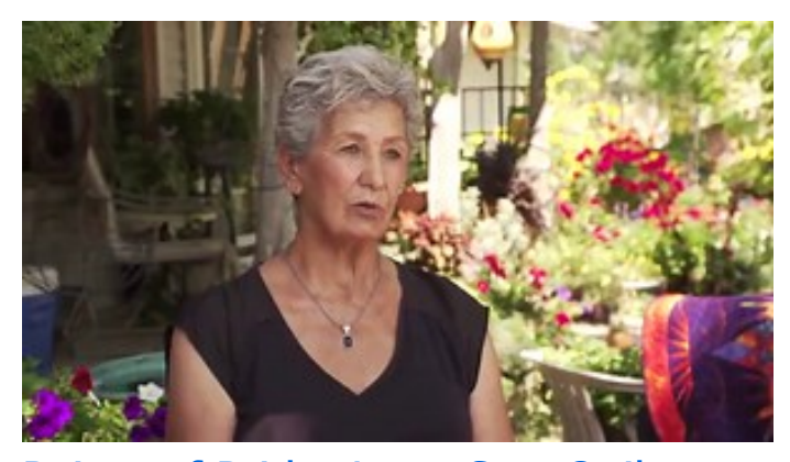
<u>Points of Pride: Lone Star Quilts</u> <u>www.youtube.com</u>