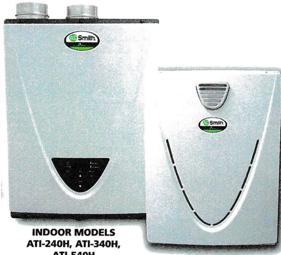
INDOOR MODELS ATI-240H, ATI-340H, ATI-540H