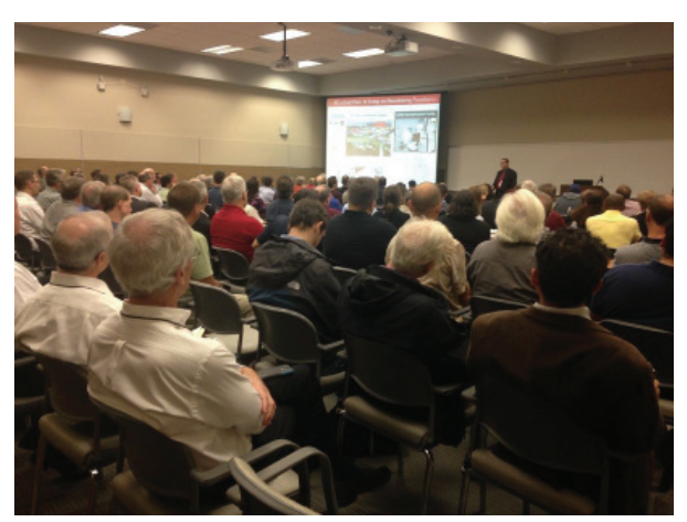
PCB Carolina 2016

Continuing education is a must in the electronic product design world. This includes keeping up with the latest industry standards including IPC, ANSI, MIL, etc. as well as PCB fabrication and assembly processes. Technologies like the Internet of Things (IoT) and rigid-flex circuits are becoming commonplace in today's electronics from automotive to medical to consumer and beyond. PCB