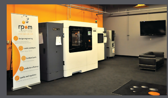
Three of rp+m's FDM additive manufacturing machines.

As Digi, Oreck and Thogus / rp+m have shown, financial justification of a new AM system based solely on jigs and fixtures can be quite easy and the outcome quite profitable. The important elements of these justifications are to equate the ease and simplicity of AM with more fixtures put into service. Then carry the savings out to the production floor to calculate labor reduction and profit gains from getting product on the shelves sooner.