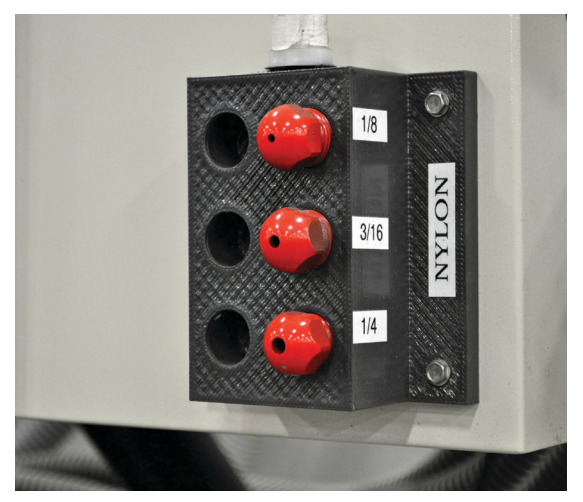
Injection molding nozzles organized in an additvely manufactured work holder to make them accessible to press operators.

results in a savings of $4.70 per changeover, per press. With 30 presses and an average of 150 changeovers per year, Thogus realizes an annual savings of $21,150 each year from just two simple organizational aids.