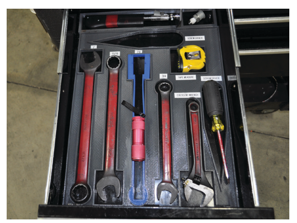
FDM 5S organizer for hand tools improves Thogus efficiency.

In the 5S category, Gannon offered two examples from the hundreds dispersed throughout the Thogus production floor: nozzle holder and knockout rod holder. Both of these 5S organizers are located at each of the company's 30 injection molding presses. Operators turn to these holders every time there is a change to a press setup. The nozzle holder eliminates seven minutes when a press operator is looking for the nozzle for a new setup. The knockout-holder eliminates 10 minutes. At Thogus' burdened hourly rate, that