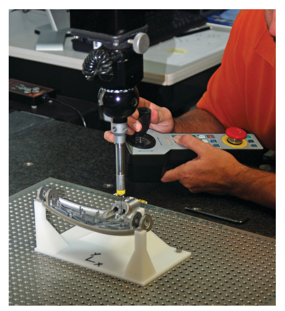
Using AM fixtures, Oreck completes CMM programming before first articles arrive.

$100,000 to $500,000 increase in gross profit that could result from a 29-day inspection plan and starts its CMM programming when a tooling order is released, not after samples are received. So, the QA department is ready and waiting for arrival of the first samples.