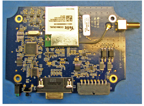
A typical PCB for Digi.

Although traditionally made manufacturing tools could produce the same financial results, AM's advantage is that it's easier and quicker to implement. The result is a deployment of fixtures where they previously did not exist. Making these items with AM is a simple, efficient and nearly labor-free task that does not require the overhead of highly skilled CAM programmers and machinists.