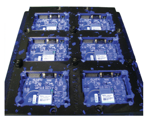
FDM hybrid mask (black) shields PCB components from conformal coating (blue under ultraviolet light).

With hybrid carrier and masking fixtures produced through FDM additive manufacturing, Digi reduced masking labor by 55 seconds per PCB for its outdoor product, which will yield a $123,750 labor savings. This single fixture has an annual savings greater than that for all engineering-related AM applications combined. Larsen acknowledged that this financial gain would be possible with a