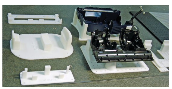
Even simple CMM fixtures can save hours in the inspection process.

Rp+m is a strategic partner of Thogus, a custom plastic injection molder. Located within Thogus' plant, rp+m's impact on production is obvious —