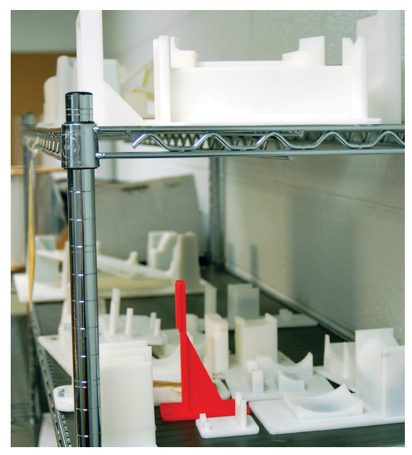
Additive Manufacturing made fixtures are prevalent in Oreck's QA lab.

Over the past few years, Oreck has used AM to make hundreds of inspection fixtures for its coordinate measuring machines (CMMs). On average, it saves $200 and 6.5 days versus having them machined. However, the most significant financial gain is a conservatively estimated