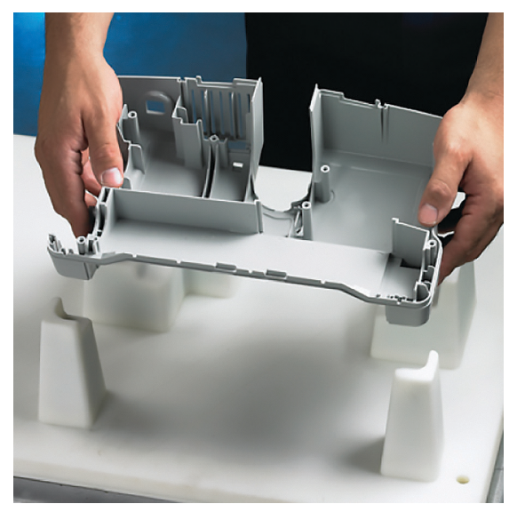
Assembly line pallet saved Oreck $65,000.

of AM-made jigs and fixtures. In one case, it saved $65,000 by lowering the fabrication costs reduction in time- to-market.