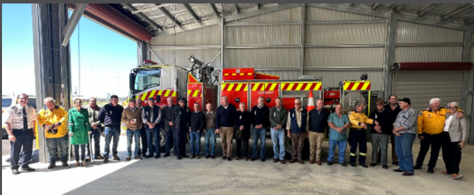
GUNNARY BRIGADE RECIEVED A CATEGORY 1 GRASSLAND TRUCK, THAT WILL BE STATIONED AT THE BOOROWA RFS COMBINED STATION

The Boorowa RFS Combined Station was officially opened on the 7th of October. The large 5-bay shed complete with a well-equipped multipurpose room, is now home to the Boorowa Support, Boorowa North, Boorowa – Hughstonia and Gunnary Brigades. During the shed opening to Gunnary Brigade was presented with the new Gunnary Cat 1 tanker.