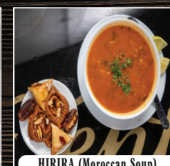
HIRIRA (Moroccan Soup)