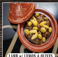
LAMB w/ LEMON & OLIVES