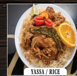
YASSA / RICE