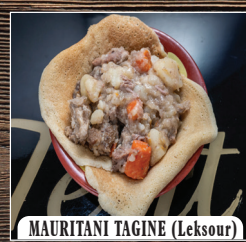
MAURITANI TAGINE (Leksour)