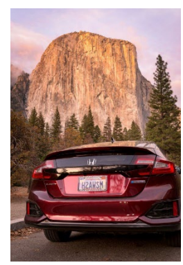
With H2AWSM at Yosemite in 2018

In much of his spare time he travels to interesting places in California, pushing the range limits of his fuel cell car ( ), promoting FCEVs and taking splendid photographs.