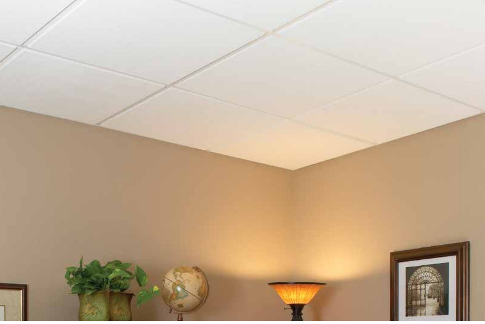
Sand Micro™ Customline® Reveal (SMCL-224)