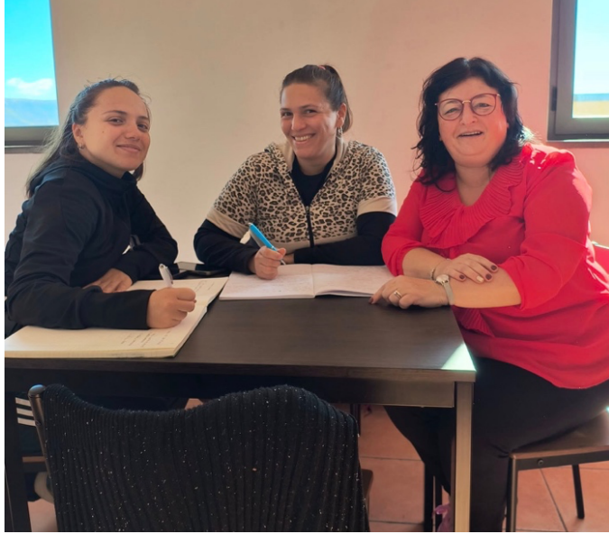
(Photos are of actual local citizens in Abruzzo who are benefitting from the program).