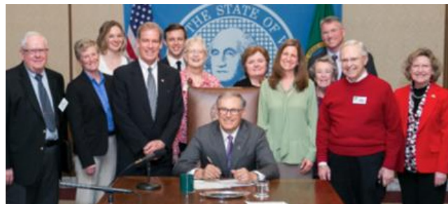
Governor Jay Inslee signs RCW 18.390

Your membership fees help offset the printing costs for the Consumer Guide to Continuing Care Retirement Communities in Washington State prepared by WACCRA.