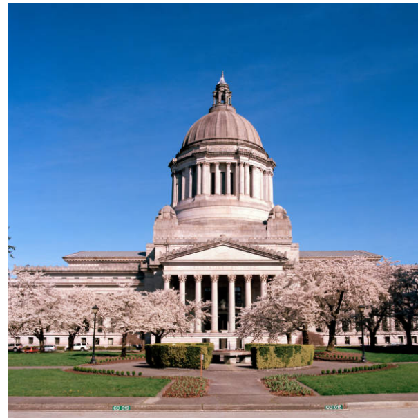
State Capitol of Washington

WE ADVOCATE for consumer rights and protections on behalf of seniors, ensuring these protections are enforceable through state regulations. We are helped in this effort by a part-time lobbyist – a paid position. A strong and robust WACCRA membership is crucial if we are to achieve results. The volunteers, membership dues, and donations fuel these Advocacy activities. A strong membership, through sheer numbers, also speaks loudly in Olympia. Public policy affecting seniors is a key concern of WACCRA. We have sponsored or supported legislation and regulations that benefit seniors since 2015. We continue to pursue our legislative agenda to empower residents.