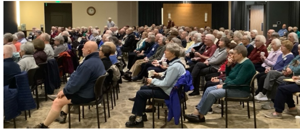
WACCRA Annual Meeting Audience

Anyone can become a WACCRA member – whether a CCRC resident or not. Membership forms are available on the WACCRA website, www.waccra.org .