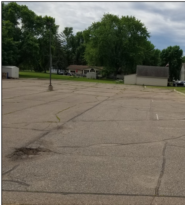
Picture above: parking lot showing it's wear. Pictured right: Stair railing in the front of the church rusted through.