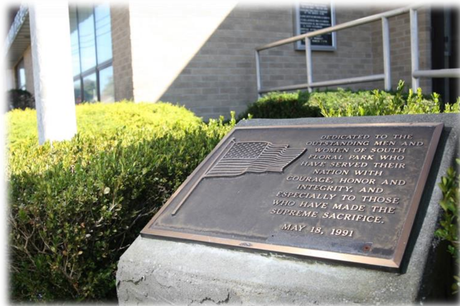
South Floral Park Resident Handbook 2012 Edition (Updated 12/28/16)