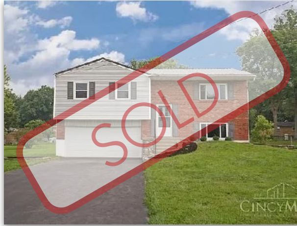
794 Danny Dr

Notes: Lower level new flooring, main level continuous hardwood, all new upgraded appliances, new deck, replaced roof, AC