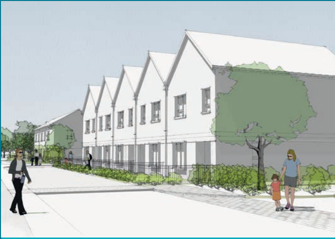
Illustrative view showing new homes with route to park/Clarendon Road.

Since holding the first public consultation in January, Sempra Homes has now developed detailed proposals for new homes on land at Tyefields.