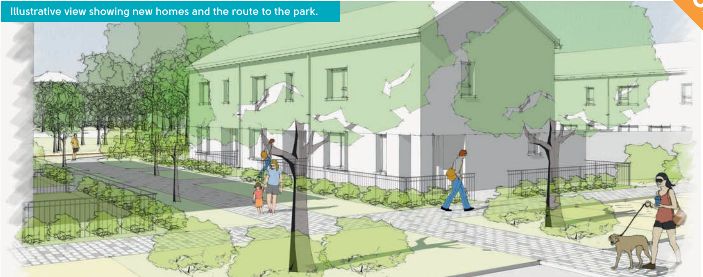
Illustrative view showing new homes and the route to the park.