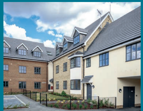
We have recently completed Maplewood Court in Lee Chapel and Cherry Tree Court in Laindon.