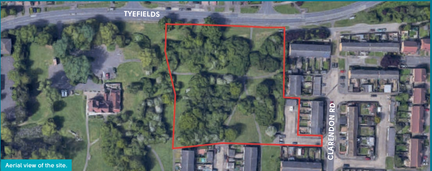
Aerial view of the site.

A second public consultation, about our detailed proposals, has now opened for you to have your say, with interactive events next week.