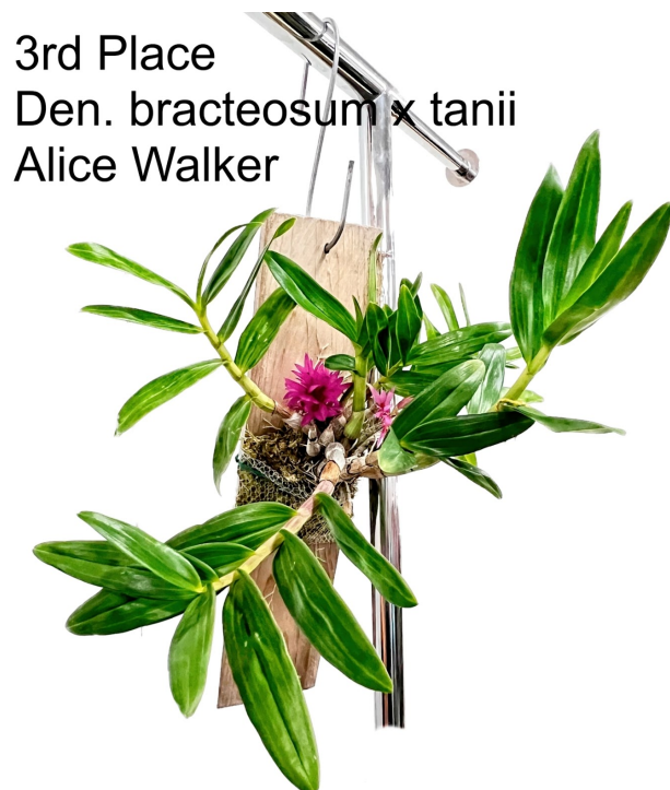
3rd Place Den. bracteosum x tanii Alice Walker