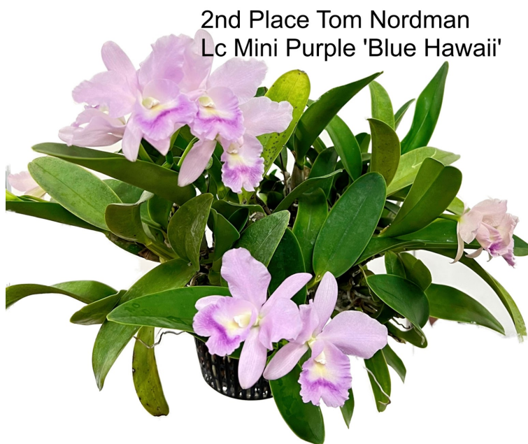
2nd Place Tom Nordman Lc Mini Purple 'Blue Hawaii'

Congratulations to our winners and thanks to everyone who brought in a blooming orchid from their collection. We are excited to share your selections as Members Choice Award recipients during last month's contest. In case you weren't able to attend, here are photos of the selected winners. Bring in your blooming orchid to be considered in next month's display.