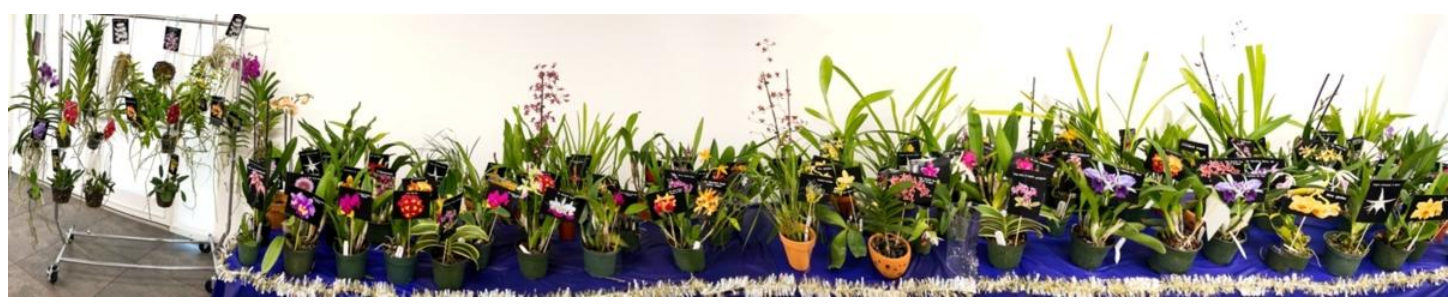
2024 Annual Holiday Party gift orchids.