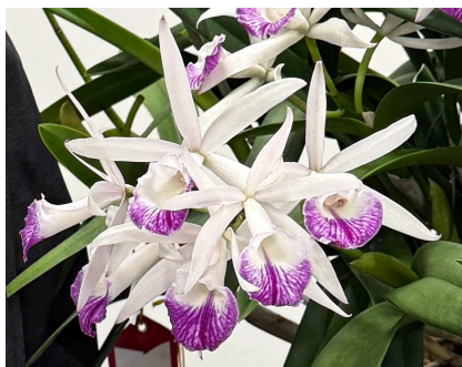
Blc. intermedia x Morning Glory 'Doris'