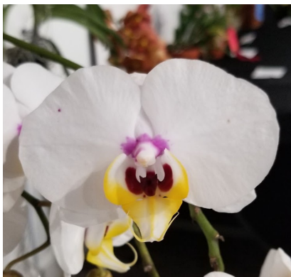
2nd Place Phal. White Grown by: Jeanne Cook