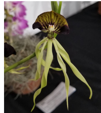
2nd Place Psh. Cathleate Grown by: Robin Burfeinot