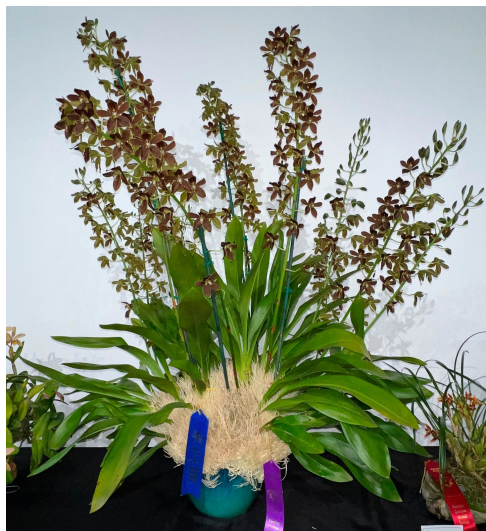
1st Place Speaker's Choice Grammatophyllum scriptum Grown by: Tom Nordman

Congratulations to our winners and thanks to everyone who brought in a blooming orchid from their collection. We are excited to share your selections as Members Choice Award recipients during last month's contest. In case you weren't able to attend, here are photos of the selected winners. Bring in your blooming orchid to be considered in next month's display.