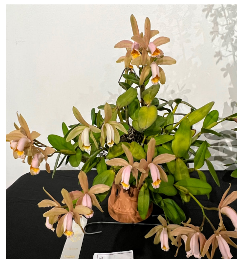
3rd Place C. forbesii Grown by: Sandi Block-Brezner