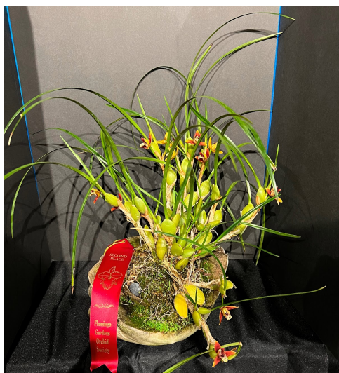
2nd Place Maxillaria tenuifolia Grown by: Dianne Rollins