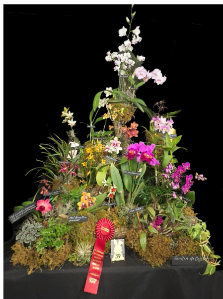
JARDIN DE COLORES