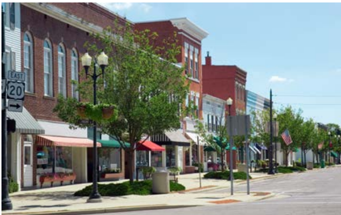
Consider your community's vision for its downtown environment.