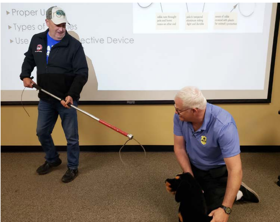
Practicing the Use of the Catch Pole to Humanely Snare a Dog As part of most of ACCA's certification courses, animal handling and equipment use is covered and usually accompanied by practice and practical skills assessment by the instructor.

Dealing with a crisis? Call or email us for information. ACCA has a variety of options available and a nimble ability to respond.