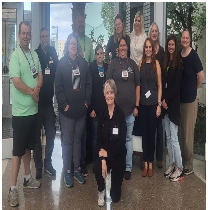
Some of the hard-working Boards of Directors for MACA and the Missouri Coalition of Animal Care Organizations, with Best Friends Animal Society.