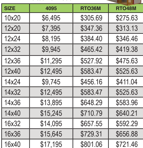
ULB - Urethane Lofted Barn