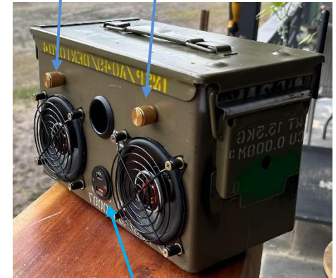
Battery Status Meter