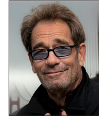
LIFETIME ACHIEVEMENT HUEY LEWIS