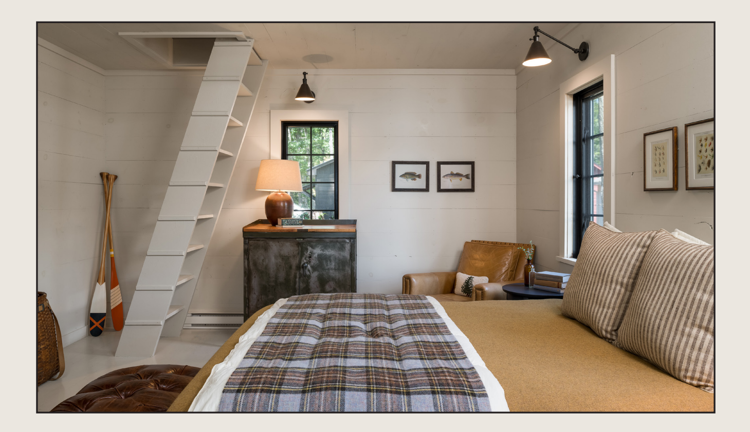
The camp's second bedroom and a sleeping loft.