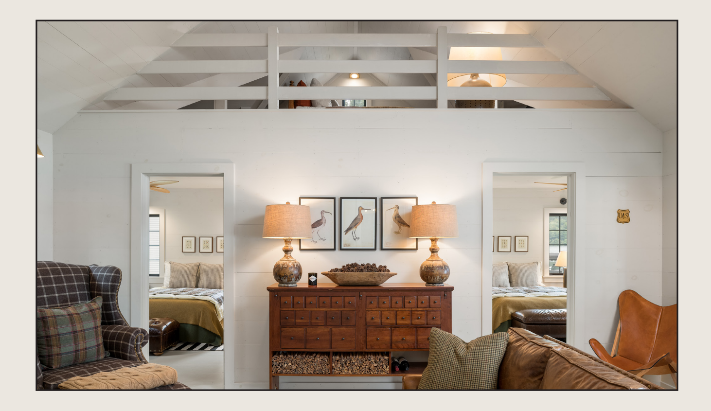
Transformation of the living area and adjacent bedrooms and sleeping loft.