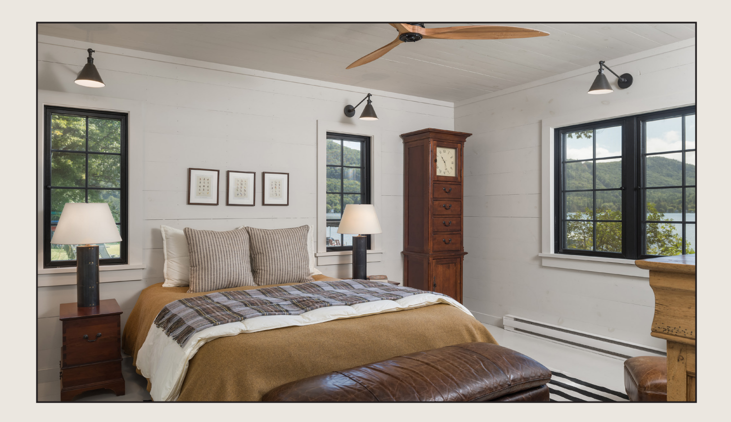
Transformation of one of the camp's lakeside bedrooms.