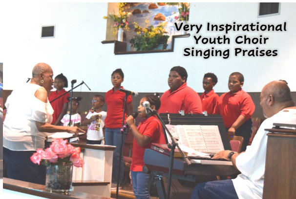
Very Inspirational Youth Choir Singing Praises