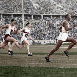
Jesse Owens Olympic Medalist, Track

IN AUGUST 1936 , JESSE OWENS WON FOUR GOLD MEDALS IN THE OLYMPIC GAMES IN BERLIN, GERMAN, MUCH TO THE DISMAY OF A. HITLER AND THE NAZIS.. OWENS WON GOLD MEDALS IN THE 100M, 200M, 4X100M RELAY AND LONG JUMP.