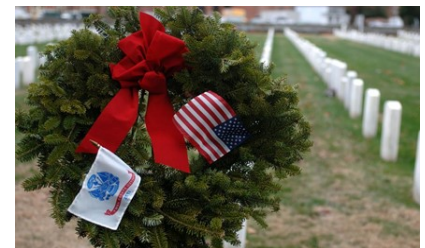
Wreaths Across America

If you or a friend would like to donate to Wreaths Across America, you can click on this website to go directly to the chapter’s page for donations helping the Ft. Mitchell Cemetery receive wreaths. You can even donate (purchase wreaths) in memory of someone.